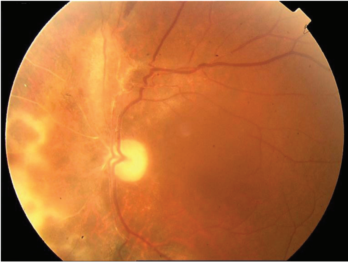
Figure 2 Regression of retinitis following treatment with ganciclovir, leaving retinal pigment epithelial changes and pale optic disc.

retinitis may present with less typical manifestations making the correct diagnosis more challenging. Prompt treatment with administration of antiviral agents is mandatory for the arrest of retinitis progression, earlier rehabilitation and prevention of more sinister complications.