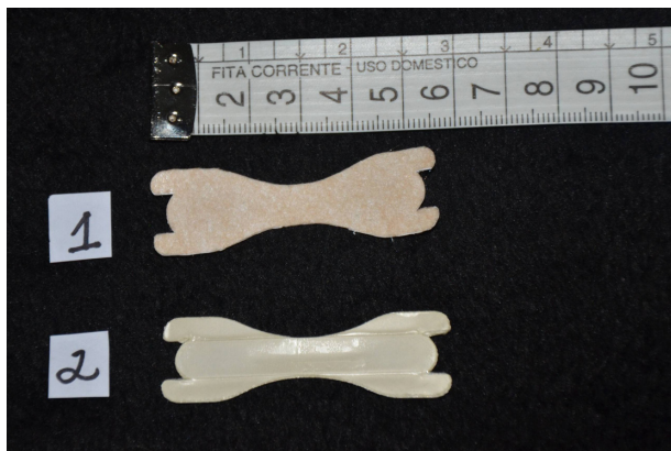
Figure 4 Placebo external nasal dilator strip (1) and experimental external nasal dilator strip (2) used by Dinardi et al. 33

Dinardi et al 33 evaluated the effectiveness of ENDs (Figure 4) in healthy adolescent athletes and compared experimental and placebo groups and reported an improvement in VO_2\max ( 53.0 \pm 4.2 mL/kg \cdot min -1 and 51.2 \pm 5.5 mL/kg \cdot min -1 , respectively) ( P<0.05 ); decrease in heart rate after cardiorespiratory test (experimental =159 bpm and placebo =168 bpm) ( P=0.015 ); improvement in nasal patency measured by the PNIF ( 123 \pm 38 L/min and 117 \pm 35 L/min, respectively); and decreased dyspnea evaluated by VAS ( P<0.05 ).