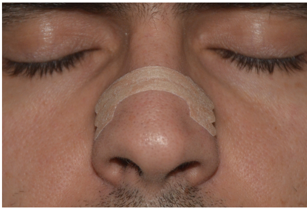
Figure 1 Front view of the external nasal dilator application site.