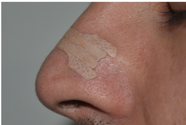
Figure 3 Side view of the external nasal dilator application site.