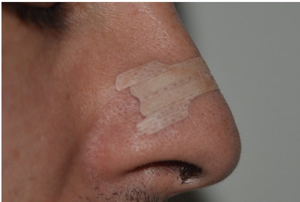
Figure 2 Side view of the external nasal dilator application site.