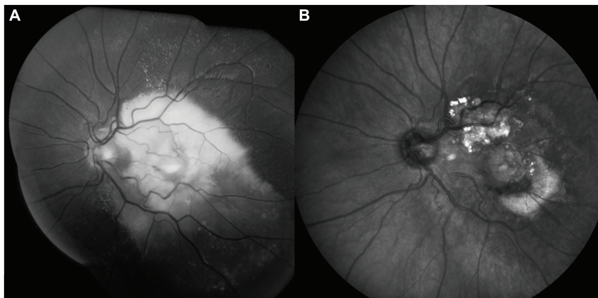
Figure 1 The patient has a total (fovea-involving) exudative retinal detachment. Notes: Fundus photograph of patient one at presentation (A). After treatment (B).

Twenty-four children presented with exudative retinal detachment associated with advanced Coats' disease. Mean patient age was 62 months (range 9–160 months). Seventeen children were boys (71%), and 7 were girls. Presenting signs included retinal detachment in 24 children (100%), vascular telangiectasia in 24 children (100%), and retinal ischemia in 24 children (100%). Twenty of 24 children presented with elevated, vascular leakage in the fovea (83%). Two children presented with sub-retinal fibrosis associated with presumed long-standing retinal detachment without evidence of rhegmatogenous retinal detachment. Ten patients exhibited vascular alterations in the periphery of the second eye without clinical evidence of exudation. All 24 children were treated with a large-spot-size diode laser in areas of abnormal