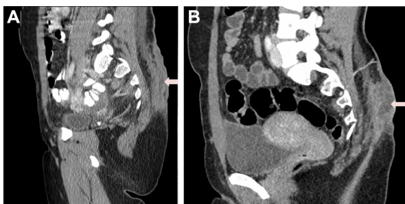
Figure 1 Pilonidal abscess, sagittal computed tomography (CT) images on admission (A) and time of neutrophil recovery (B). (A) CT scan showing soft-tissue ill-defined thickening from the lumbar spine to the sacrum, with a focal well-defined fluid collection measuring approximately 2.9 \times 0.8 cm (arrow). (B) Three weeks postinduction CT sagittal images showing increase in well-defined fluid collection, now measuring 1.3 \times 2.2 \times 6.4 cm (marked with arrow).

A 32-year-old woman with remote history of pilonidal abscess presented with easy bruising, fatigue, generalized bony pain, and heavy menses. She was found to have acute myeloid leukemia (AML) with 34% bone marrow blasts and t(8;21) (q22;q22). She was placed on levaquin, acyclovir, and posaconazole for prophylaxis, and induction chemotherapy with standard daunorubicin and cytarabine was initiated for a total of 7 days. While neutropenic, she developed an area of tenderness and erythema around her sacrum in the previous site of a pilonidal cyst and then became febrile. Cefepime was initiated, and was later changed to vancomycin and piperacillin/tazobactam because of suspected rash from cefepime. She remained febrile for 3 days after initiating antibiotic therapy. Blood cultures were drawn and remained negative. Computed tomography (CT) of the pelvis revealed ill-defined soft-tissue thickening in the mid-lower back from the lumbar spine to the sacrum within the deep subcutaneous fat to the gluteal crease without any evidence of muscular involvement. There was also a well-defined fluid collection measuring approximately 2.9 \times 0.8 cm within the subcutaneous tissues, superficial to the lower sacrum and to the right of the midline (Figure 1A). Erythema and fever resolved, and tenderness