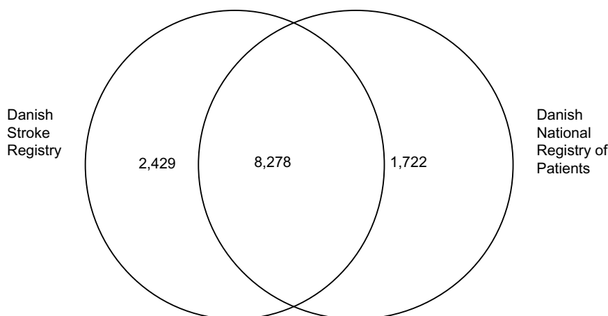
Figure 1 Number of patients registered with stroke in the Danish Stroke Registry, the Danish National Registry of Patients, and in both data sources in 2009.

Of the 156 medical summaries that were reviewed using the second approach, we identified 74 cases of acute stroke. Table 2 shows that based on data from the second approach,