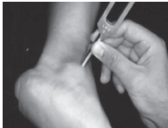
Figure 2 Use of 128 Hz tuning fork.

fork is held over bony prominences such as the first metatarsal head and the lateral malleolus (Figure 2), and the test is considered positive when the patient is unable to perceive any vibration that the examiner can perceive (Singh et al 2005). The 5.07/10 g Semmes Weinstein monofilament consists of a plastic handle supporting a nylon filament (Figure 3) and is one of the most frequently utilized screening tools to identify loss of protective sensation in the United States (Armstrong 2000; Singh et al 2005). Testing via the Semmes Weinstein monofilament is administered with the patient sitting supine in the examination chair with both feet level. The monofilament is applied perpendicular to the skin until it bends or buckles from the pressure, left in place for approximately one second and then released (Singh et al 2005). The patient with his or her eyes closed responds “yes” each time he or she perceives the application of the monofilament.