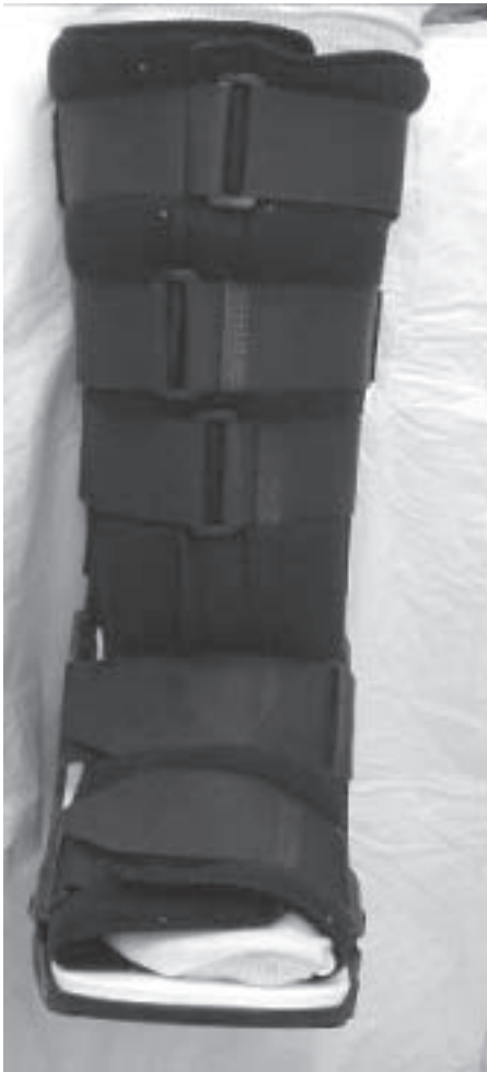
Figure 7a Removable cast walker.

to 100% over a course of 5–7 weeks (Helm et al 1984; Walker et al 1985; Sinacore et al 1987; Walker et al 1987; Myerson et al. 1992). However, the application of TCC is time consuming and often associated with a learning curve. Most centers do not have a physician or cast technician available with adequate training or experience to safely apply a TCC; improper cast application can cause skin irritation and in some cases even frank ulceration. In addition TCCs do not allow daily assessment of the foot or wound and are therefore often contraindicated in cases of soft tissue or bone infections. Recent studies have shown that an instant total contact cast (iTCC), made by simply wrapping a removable cast walker with a single layer of cohesive bandage, elastoplast, or casting tape (Figure 7a, b, c), may be just as effective as a TCC in pressure mitigation and the healing of diabetic foot ulcers (Wu et al 2005). A randomized controlled study compared the standard TCC with an iTCC (Katz et al 2005) and found no differences in healing rates and mean healing time between patients who received the TCC versus the iTCC. The proportions of patients