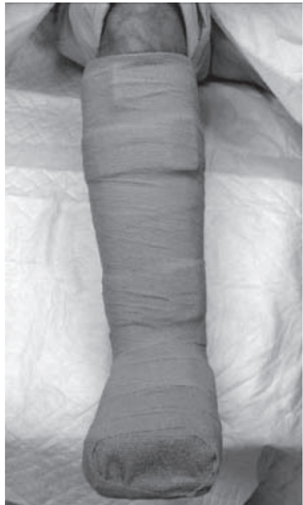
Figure 7b Instant total contact cast: made by wrapping the removable cast walker with a layer of cohesive bandage.

There is a high occurrence of foot ulcers within the population of people with diabetes. Foot ulcerations may lead to infections, lower extremity amputations and are major causes of disability to patients, often resulting in significant morbidity, extensive periods of hospitalization, and mortality. In order to diminish the detrimental consequences associated with diabetic foot ulcers, a high standard of care must be provided. Many of the etiological