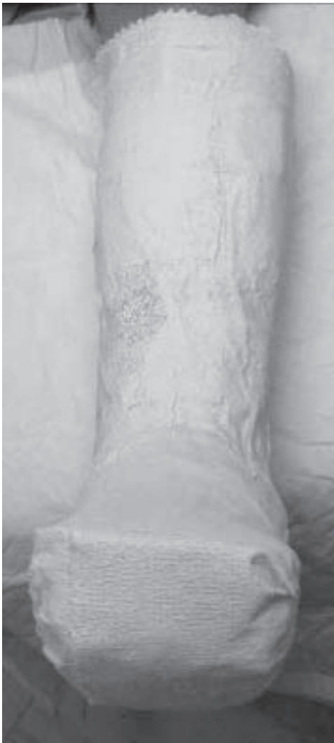
Figure 7c Instant total contact cast: made by wrapping the removable cast walker with a layer of plaster of paris.

factors contributing to the formation of diabetic foot ulceration may be identified using simple, inexpensive equipment in a clinical setting, and early recognition of these factors along with prompt management of the ulcers are essential for successful outcome (Van Damme and Limet 2005). Aggressive treatment of infections, correction of vascular occlusive disease, adequate wound care, and appropriate pressure mitigation are essential steps in the treatment protocol (Van Damme and Limet 2005). With the implementation of good prevention and treatment programs, a significant reduction of lower extremity complications well within reach.