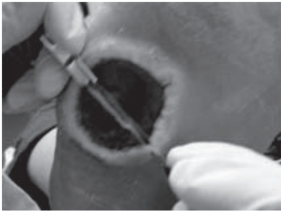
Figure 5 Debridement of wound margins to mitigate the “edge effect”.

surgical debridement, the most direct and efficient method to clean the woundbed (Blanke and Hallern 2003), is generally considered the gold standard.