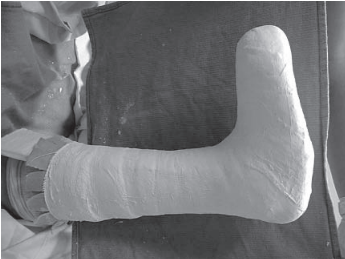
Figure 6 Total contact cast.

With sufficient vascular supply, appropriate debridement, moist wound environment, and infection control, the primary mode of healing a diabetic neuropathic foot ulcer is pressure dispersion (Armstrong et al 2004; Wu et al 2005). Of the plethora of offloading modalities including bed rest, wheel chairs, crutches, total contact casts, felted foam, half shoes, therapeutic shoes, custom splints, and removable cast walkers, total contact casting (TCC) (Figure 6) is considered by many to be the “gold standard” in achieving pressure redistribution (Coleman et al 1984; Walker et al 1985; Boulton et al 1986; Sinacore et al 1987; Walker et al 1987; Kominsky 1991; Lavery et al 1997). TCC has been shown to reduce pressure at the site of ulceration by 84%–92% (Lavery et al 1996) and is quite effective with healing rates ranging from 72%