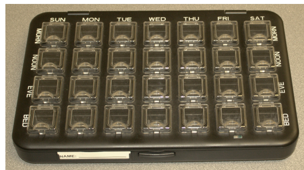
Figure 1 MedMinder medication tray.

Self-determination theory was used as the underlying behavioral change theory for this mHealth program. Self-determination theory is directed at building confidence (ie, self-efficacy) in the ability to engage in and increase motivation to sustain desired behaviors. Building sustained motivation in self-determination theory focuses upon development of autonomous regulation, which is fostered by inculcating a sense of ownership and meaning over one's behavior change. 30,31 Behaviors consistent with personal values and/or short-term and long-term life goals are more likely to be sustained than those resulting from external cues (eg, "doctor's orders") or negative internal (eg, shame, guilt) pressures. 31 Based upon their disease management behaviors