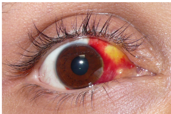
Figure 4 An island of yellow discoloration on the nasal part of the bulbar conjunctiva indicating absorption of the subconjunctival hemorrhage.

There is not any approved treatment to accelerate the resolution and absorption of SCH. The first treatment reported in the literature was air therapy. 74 A patient with a severe SCH caused by acute hemorrhagic conjunctivitis was treated