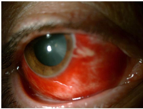
Figure 1 This patient with diffuse subconjunctival hemorrhage had uncontrolled hypertension.

have a systematic review scheme in mind, and major causes can be classified under ocular and systemic conditions, respectively.