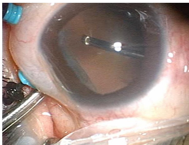
Figure 2 Pars plana vitrectomy using a 25 gauge system.

Note: Vitrectomy was performed using the scleral depression technique to remove the ciliary block.