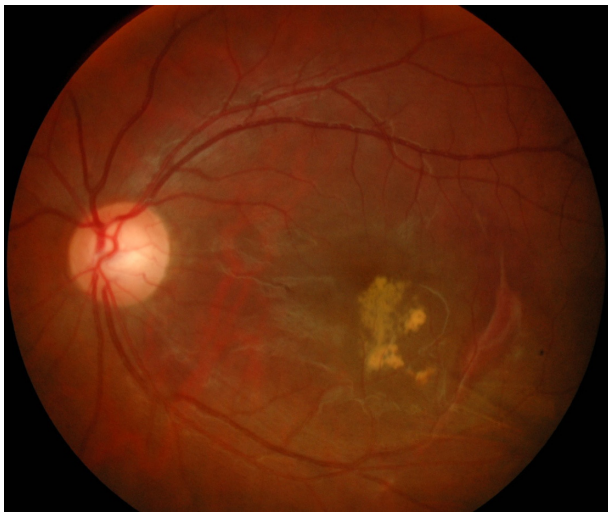
Figure 3 Left fundus showing complete resolution of submacular hemorrhage with fibrosis scar and choroidal rupture scar at 4 weeks post-intravitreal ranibizumab.

The basis of its effectiveness in treating traumatic submacular hemorrhage as in our case is not clearly known. We postulate that the anti-VEGF property as an anti-inflammatory agent played an important role.