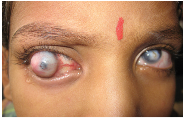
Figure 3 Grade III dermoid with staphyloma.

such as ring dermoid syndrome with conjunctival extension, preauricular tags, palpebral coloboma, Goldenhar's syndrome (preauricular fistulae, preauricular appendages, and epibulbar dermoids or lipodermoids), and the mandibulofacial dysostosis of Franceschetti syndrome. 9,10 Goldenhar's syndrome has been expanded further to include vertebral anomalies and is now named Goldenhar-Gorlin syndrome. 9 Because epibulbar choristomas may occasionally be associated with epidermal nevus syndrome, one must pay close attention to the presenting signs of this syndrome. Of note, a subgroup of these lesions, ie, sebaceous nevus, is known to undergo malignant transformation. 11 Histologically, limbal dermoids show hair follicles and sebaceous gland acini within a discrete elevated nodule of fibrous connective tissue 12 (see Figure 4).