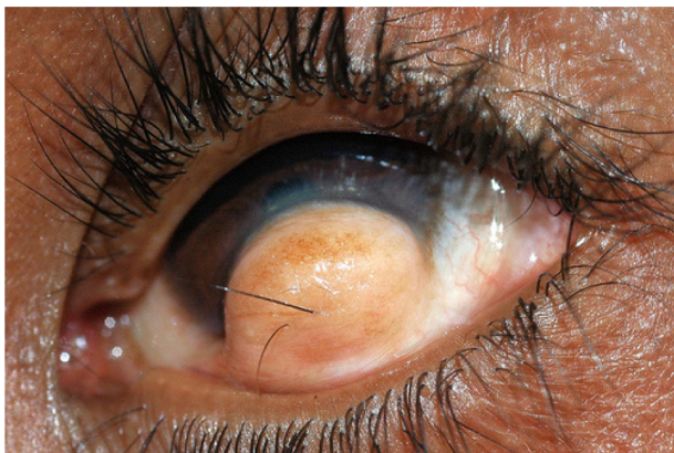
Figure 2 Grade II limbal dermoids involving nearly the entire depth of cornea up to Descemet's membrane.

A study by Nevares et al indicates that the majority (76%) of ocular dermoids occur at the inferotemporal bulbar location of the eye, with the other 22% reported to occur superotemporally. 4 In a study by the Armed Forces Institute of Pathology, 75 of 1016 such lesions were documented to be epibulbar choristomas, with more than 80% of lesions noted to be located temporally and inferiorly. 8 In another study at the Wilmer Eye Institute of Pathology, choristomas comprised 33% of all epibulbar lesions in individuals younger than 16 years of age. 9 This study showed that these lesions may sometimes be associated with other ocular findings, including scleral/corneal staphyloma, aniridia, congenital aphakia, cataract, and microphthalmia. 9 It has been reported that choristomas may or may not be associated with systemic conditions and other syndromes,