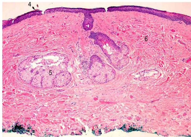
Figure 4 Histological cross-section of ocular dermoid.

The pattern of inheritance is quite variable in epibulbar choristomas. They can be autosomal dominant, recessive, X-linked, or multifactorial. 2