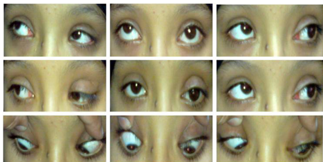
Figure 1 Preoperative presentation of Case 8 with left hypotropia and limited elevation in all gazes and one previous ptosis surgery.

Mean postoperative angle of hypotropia was 9 PD with a high statistically significant difference from the preoperative