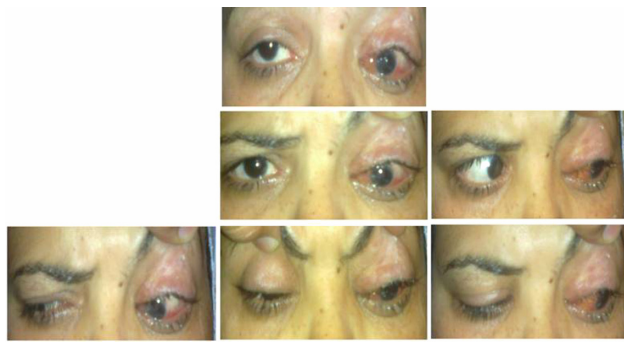
Figure 7 Postoperative pictures of Case 5 (1 month after single-stage adjustable strabismus surgery) with maximum IR recession showing limited left-eye elevation, under-corrected hypotropia, residual ptosis, and lagophthalmos due to shortened lid.

chromosome 13. This means that the CFEOM phenotype include at least 4 known genetic mutations 15 that prevent normal development of cranial nerves III and/or IV and their nuclei in different patterns. CFEOM results in an absence of superior division of the oculomotor nerve. CFEOM type 2 results in an absence of motor neurons in oculomotor and trochlear nuclei. CFEOM type 3 results in a variable developmental anomaly of the oculomotor nerve, more in the superior branch than in the inferior branch. 16 This evidence suggests that the fibrotic changes in muscles are secondary to defective innervation of the muscles during development.