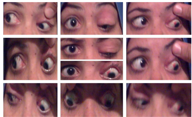
Figure 2 Preoperative presentation of Case 5 with left hypotropia and mismanaged ptosis by three sequential lid surgeries and lagophthalmos.

angle. Mean postoperative MRD was 1.5 \pm 1 mm. Lagophthalmos was improved from mean preoperative 4 mm to mean postoperative 1.2 mm. The difference was not statistically significant (Table 1).