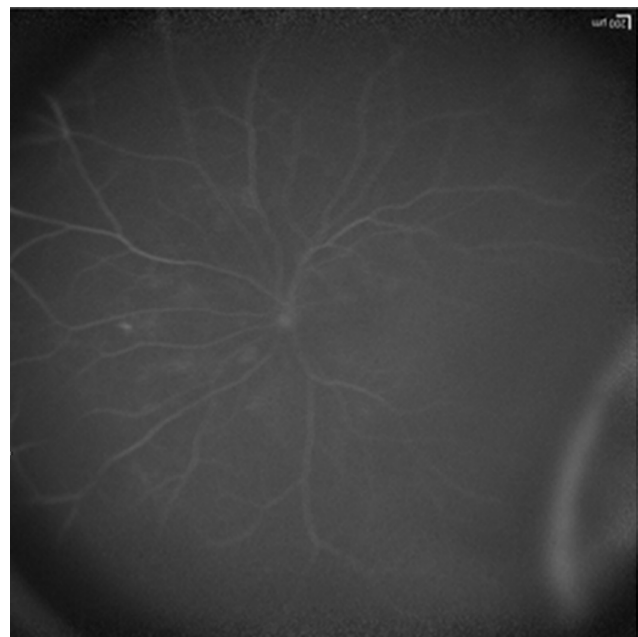
Figure 3 Ultrawidefield angiography of the left eye demonstrates irregularly staining hyperfluorescent lesion anterior to the equator in the temporal region.

crowded the angle and induced lenticular astigmatism ( -8.25 + 3.25 \times 075 ). An ultrasound showed a “mass with medium to high internal reflectivity.” The patient was offered orbital radiation to alleviate the metastasis but declined.