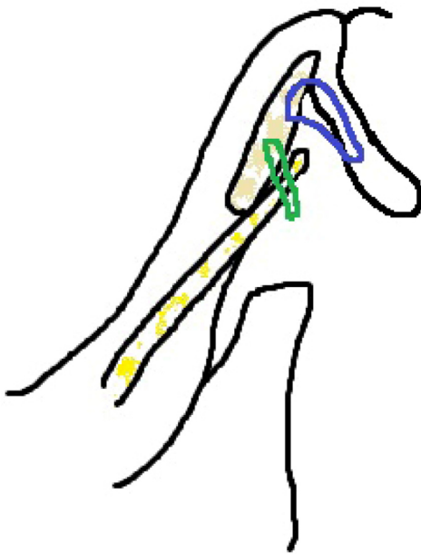
Figure 2 A simple diagram of the lower eyelid and our combination procedure. Notes: The pink round structure represents the tarsus, and the thin yellow structure represents the capsulopalpebral fascia (CPF). The green circle shows the binding location of the CPF and the tarsus. The blue circle shows the ciliary everted suture, which ties the dermis to the tarsus.