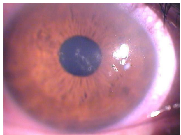
Figure 1 Biomicoscopic image of the right eye of a 27-year-old male patient one day after corneal collagen cross-linking with riboflavin and ultraviolet A irradiation. Note: The epithelium shows some superficial irregularity, but the overall cornea appears very clear.

Sixteen eyes from 16 patients (eight men, eight women) with keratoconus were included in the study. The mean age of the patients was 34.4 ± 11.9 (range 18–61) years. All patients attended the 6-month follow-up. One-year follow-up results were available for seven patients. All procedures were uneventful and no intraoperative complications were observed. No damage to the limbal region of any patient was observed. The epithelium was completely healed within one day after treatment (Figure 1) in all patients. Intraocular pressures evaluated by Goldmann applanation tonometry were less than 18 mmHg in all eyes. Fundus examinations were within normal limits. In the treated eyes, the corneal thicknesses and the endothelial cell densities and morphologies