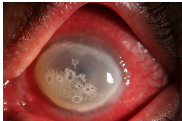
Figure 2 Corneal Ulceration in Anesthetic Keratopathy Resembling Mooren's Ulcer. Note: Figure demonstrates 360 degrees of corneal thinning at the limbus with a noticeable undermined edge, diffuse corneal haze is also observed.