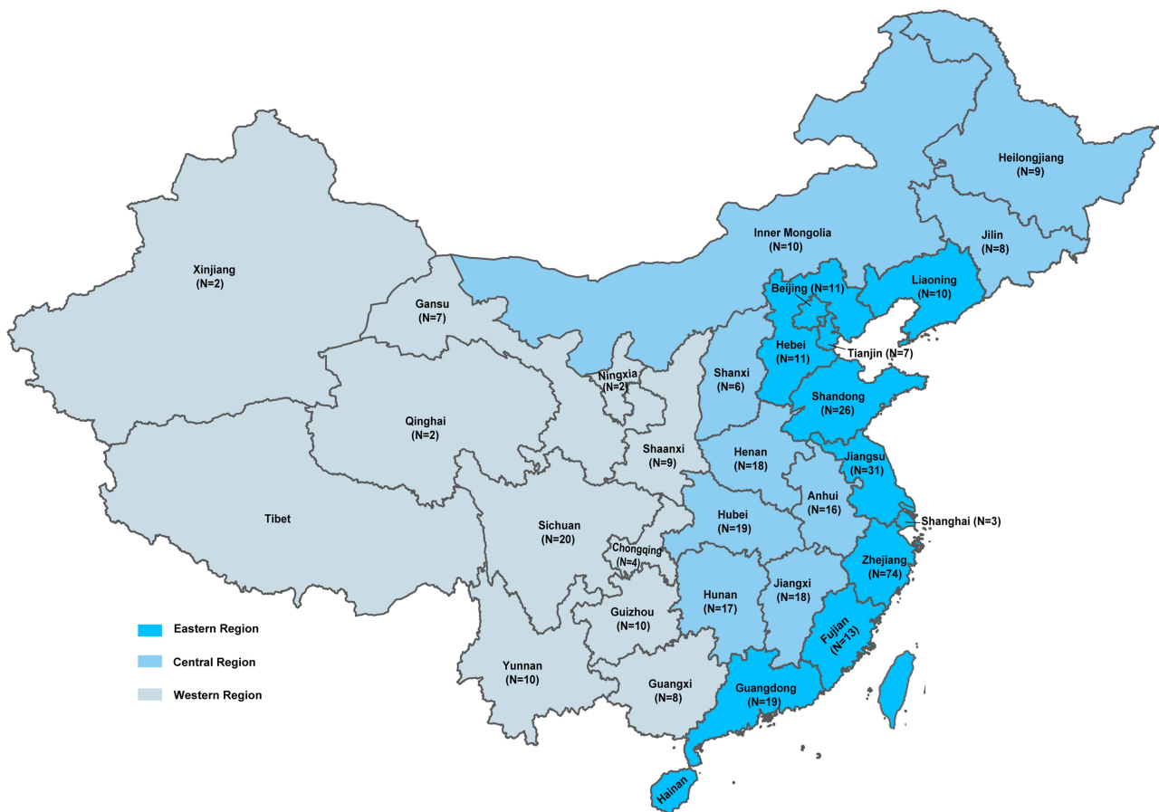
Figure 1 Geographic distribution of surveyed hospitals. Distribution of participating hospitals across China's eastern, central, and western regions (N = 400).

Overall, 261 of the 400 responding hospitals (65.3%) reported currently offering 24-hour IOP monitoring services. A significant difference in adoption rate was observed between hospital types ( p < 0.01 ). Private ophthalmic hospitals demonstrated a higher implementation rate (74.7%, 112/150) compared to public tertiary hospitals (59.6%, 149/250) (Figure 2A).