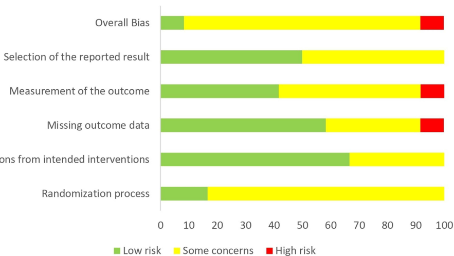
Figure 3 Summary of RoB.

seven trials, encompassing both commercially available platforms such as Lumosity ® , 4,20 Braingymer ® , 22 RehaCom, 24 and Scientific Braintraining PRO, 23 as well as custom-built solutions, including multi-touch table systems 3 and purpose-built cognitive software. 5