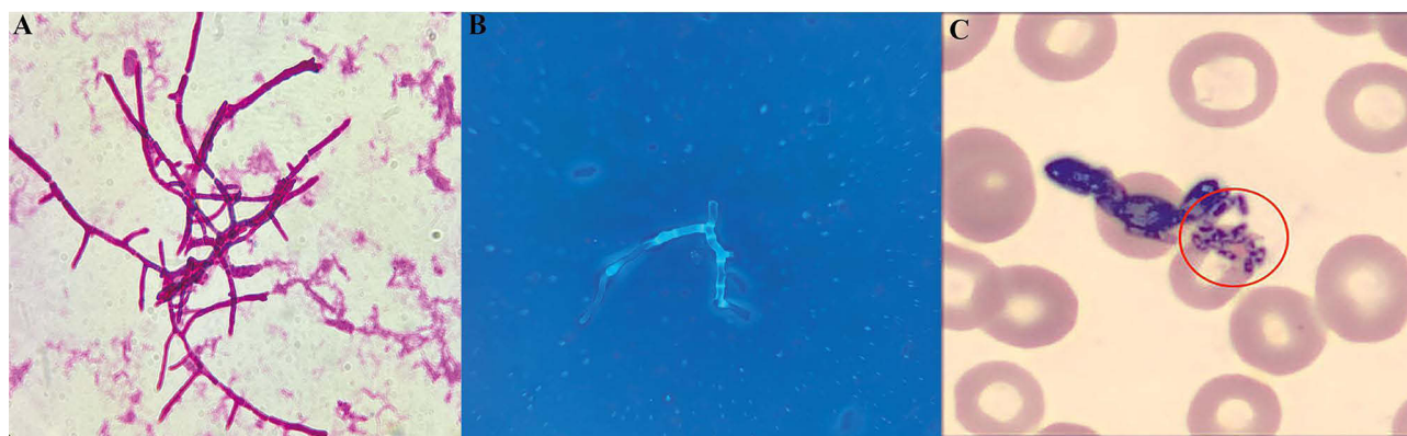
Figure 1 Morphology of fungal elements in blood culture smears observed under light and fluorescence microscopy using Gram and fungal fluorescent staining showed septate hyphae with an antler-shaped morphology. (A) Gram-stained smears under light microscopy, \times 1000 . (B) Fluorescent-stained smears under fluorescence microscopy, \times 1000 . (C) Wright's stained peripheral blood smear revealed an elongated oval or sausage-shaped yeast-like fungal organism, with a transparent septum separating the cells ( \times 1000 ). The red circle highlights Talaromyces marneffeii yeast cells.

The treatment of talaromycosis in HIV-negative patients generally follows the same principles as in HIV/AIDS populations, involving an initial intensive phase with amphotericin B, followed by a prolonged consolidation phase with an azole antifungal such as itraconazole or voriconazole. 23 Given the diagnosis of T. marneffeii fungemia, and considering its nature as a deep-seated invasive fungal infection commonly occurring in severely immunocompromised individuals with notable mortality risk, amphotericin B is considered the first-line treatment. However, in our case, liposomal amphotericin B was not available at our hospital at the time of diagnosis. Moreover, given the patient's profound immunosuppression, hematologic fragility, and the potential toxicity profile of amphotericin B, an alternative approach was deemed necessary. After thorough multidisciplinary discussion and shared decision-making with the patient's family, voriconazole was selected as the initial antifungal agent. The patient received intravenous voriconazole (0.2 g q12h) for 2 weeks during hospitalization, followed by oral administration for an additional 2 weeks after discharge. The patient's body temperature remained consistently normal following two week of antifungal treatment (Figure 3), and