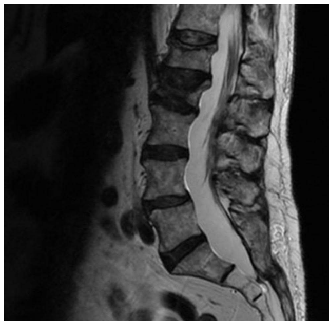
Figure 1 Sagittal T2-weighted MRI of the lumbar spine, demonstrating compression fractures at L1 and L2, grade I anterolisthesis of L4 on L5, and multilevel disc desiccation and degenerative changes.

During this time (following the medial branch RFAs), VV again presented to the emergency department for pain control and was referred to palliative care for help with symptom management given his worsening pain. By this time, VV was spending essentially all his time in bed. Consequent to this pain-associated major decline in functional status and quality of life, the idea of palliative sedation was discussed, and additional opioid treatments were utilized, including tapentadol and another trial of oxycodone. Additional trigger point injections (VV had found the initial set to be helpful, albeit transiently) and muscle relaxants were trialed as well. As somewhat of a last resort prior to further considering palliative sedation, the possibility of spinal cord stimulation was discussed with VV and his family. They expressed interest in moving forward with this therapy, and he subsequently underwent a psychological evaluation prior to a SCS