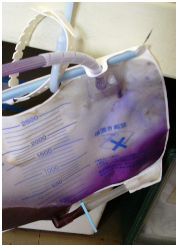
Figure 1 Purple discoloration of urine in the urine bag and tubing.

is that the female urethra is more prone to bacterial infections due to its short length and proximity to the anus. 4 Chronic constipation and intestinal obstruction are reported to be strongly associated with PUBS, 2 which is supported by the fact that a decrease in intestinal motility causes bacterial overgrowth in the intestine, which increases the metabolism of tryptophan to indole, resulting in high levels of indigo and indirubin in the urine. 9 Some studies have reported an association between self-oral intake, chronic kidney disease, and PUBS. 4,11 A case control study reported that bacterial counts in urine were significantly higher (by 1 to 2 logs) in patients with PUBS than in those without the syndrome. This suggests that a higher bacterial load in the urine is an important factor involved in development of PUBS, in addition to the aforementioned factors. 7