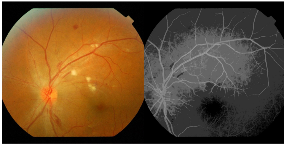
Figure 2 Cotton wool exudate and retinal hemorrhage after 12 weeks of treatment.

suspending the use of interferon in patients who develop retinopathy or any other ocular side effects. It's commonly agreed among authors that careful monitoring should be performed in the presence of any ocular sign, even without symptoms. 18