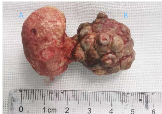
Figure 3 The calculus after removal, with (A) located in the bladder and (B) in the urethra.

refused surgical removal of the diverticulum. After urination, residual urine in the diverticulum was drained by urethral squeezing, without further flow from the urethral orifice. We recommended against vaginal delivery to prevent urethrovaginal fistula formation. During the five-year follow-up, the patient experienced mild stress incontinence and one missed abortion. Behavioral therapy was administered to manage mild stress incontinence.