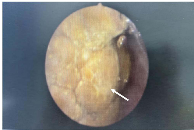
Figure 2 The arrow indicates the appearance of the calculus as observed through cystoscopy in the urethra.