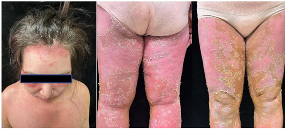
Figure 1 Clinical presentation of skin lesions before treatment.