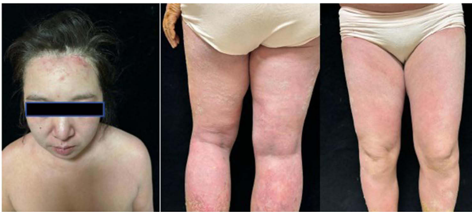
Figure 2 Clinical improvement of skin lesions following treatment.

December 2 and was hospitalized in the Department of dermatology after surgery. After completing the relevant examinations, the patient received an intravenous infusion of spesolizumab injection 900mg, and his condition improved 3 days later (Figure 2). Eighteen days later, the patient was administered Methotrexate tablets to control plaque psoriasis. Unfortunately, the patient had a strong desire to continue the pregnancy, but she was required to undergo an abortion.