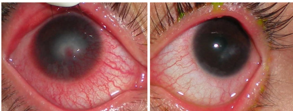
Figure 1 Corneal vascularization of the right eye (left photo) and left eye (right photo) before treatment with topical cyclosporin.

Her right eye condition remained the same despite intensive treatments. A trial with topical cyclosporin A 0.5% every 6 hours was decided on, which was the authors' first experience using topical cyclosporin for blepharokeratoconjunctivitis. There was a dramatic regression of corneal vascularization in both eyes after 3 days on topical cyclosporin (Figure 2). After 1 week of treatment, both eyes showed white conjunctiva with resolved corneal vascularization (Figure 3). Her visual acuity was markedly