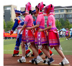
Bamboo Pole Racing