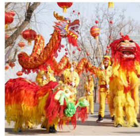
Dragon and Lion Dance