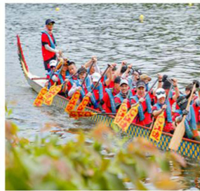
Dragon Boat Racing