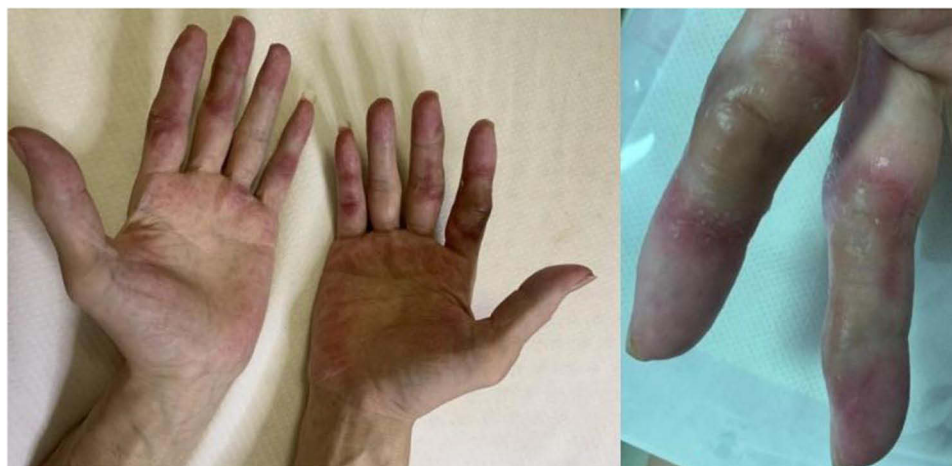
Figure 1 Palm and fingers before treatment.

He visited the outpatient clinic on August 10, 2023. The patient reported that the pain was unbearable when moving his hands, which was slightly relieved when resting, accompanied by numbness and abnormal needle-like sensations. Sensitive to temperature and cannot tolerate cold or hot water. A physical examination of his hands revealed swelling of the interphalangeal joints of the index finger, middle finger, little finger, and metacarpophalangeal joint of the ring finger, multiple bullae and erythema, and difficulty in flexing and extending the fingers (Figure 1). NRS score 4–5 points. Physical examination by traditional Chinese medicine shows a red tongue, less fur, and a thin and weak pulse.