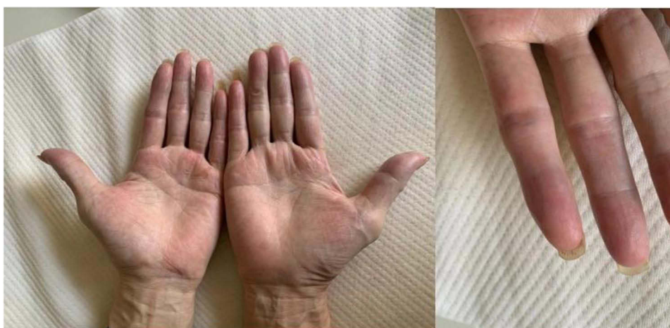
Figure 4 Palms and fingers after 21 days of treatment.