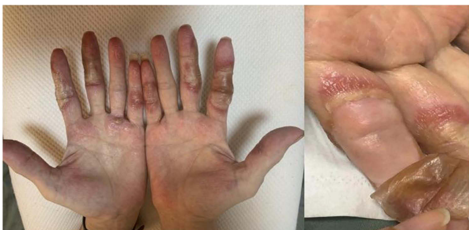
Figure 2 Palms and fingers after 7 days of treatment.