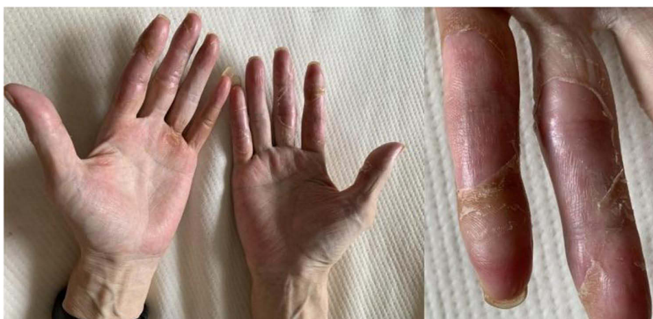
Figure 3 Palms and fingers after 14 days of treatment.