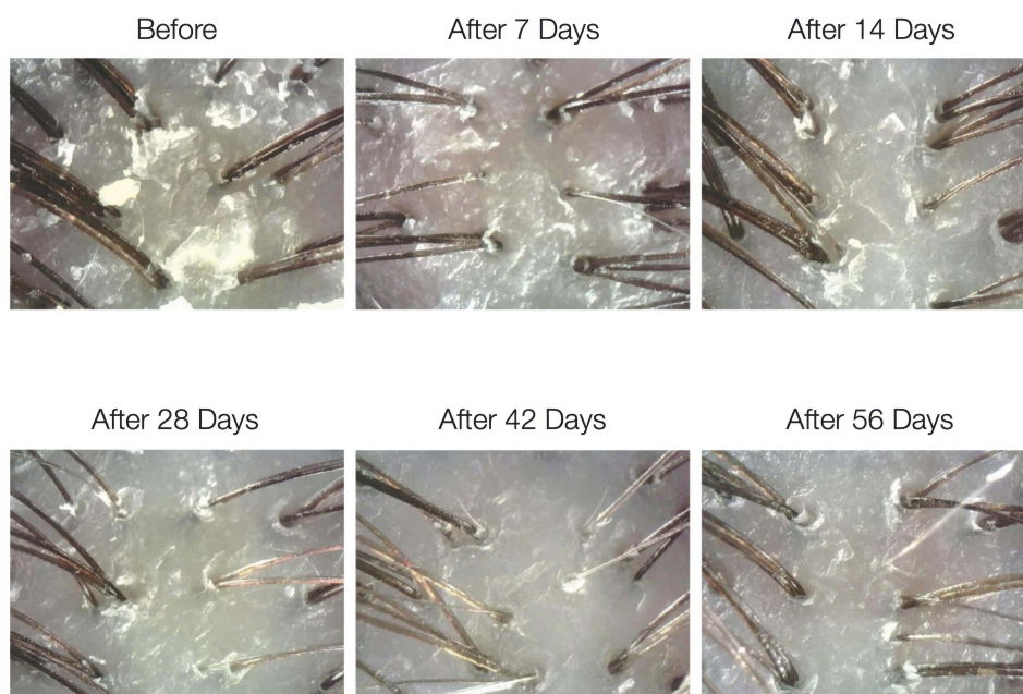
Figure 1 Aramo ASW 300F images of the surface of the scalp and hair in zoom 60-times before application and at each time point showing a reduction in flaking in subjects using Salixin Shampoo 2%.

The Salixin Shampoo 4% formulation is generally more potent but can cause deterioration in sensitive skin and redness in a few cases, likely due to its higher concentration. Dandruff severity and itching respond well to both