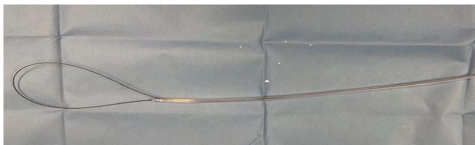
Figure 3 A photograph of the Urethrotech catheterisation device showing the guidewire, which had doubled back and entered the main drainage channel of the three-way Foley catheter.