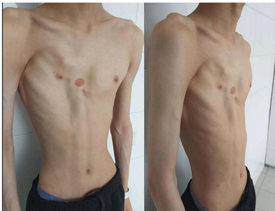
Figure 1 Patient's appearance before operation.

The patient is asthenic, height - 184 cm, weight - 59 kg. BMI - 17.4. After hospitalization, the patient underwent a computed tomography scan of the chest, which revealed local depression of the chest at the level of the third and fourth ribs and deformation of the cartilaginous parts of the ribs. After preoperative preparation, the patient underwent thoracoplasty with the installation of a wire-frame structure (Figure 2).