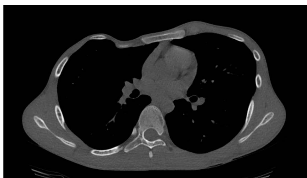
Figure 2 CT of thorax before operation.

The operation took place under intubation anesthesia. After processing the surgical field, an arcuate incision was made along the anterior wall of the chest from the level of the second rib on the right to the fifth intercostal space on the right. The skin is dissected, subcutaneous fat, periosteum and soft tissues are mobilized to the outer boundaries of the deformity. A defect in the third and fourth ribs on the right is visually noted. After skeletonizing the II to V rib on both sides to the outer boundaries of the deformation, the ends of the III and IV ribs were skinned. An autograft was taken from the cartilaginous part of the 5th rib. Then a frame structure is formed using Kirschner wires (Figure 3).