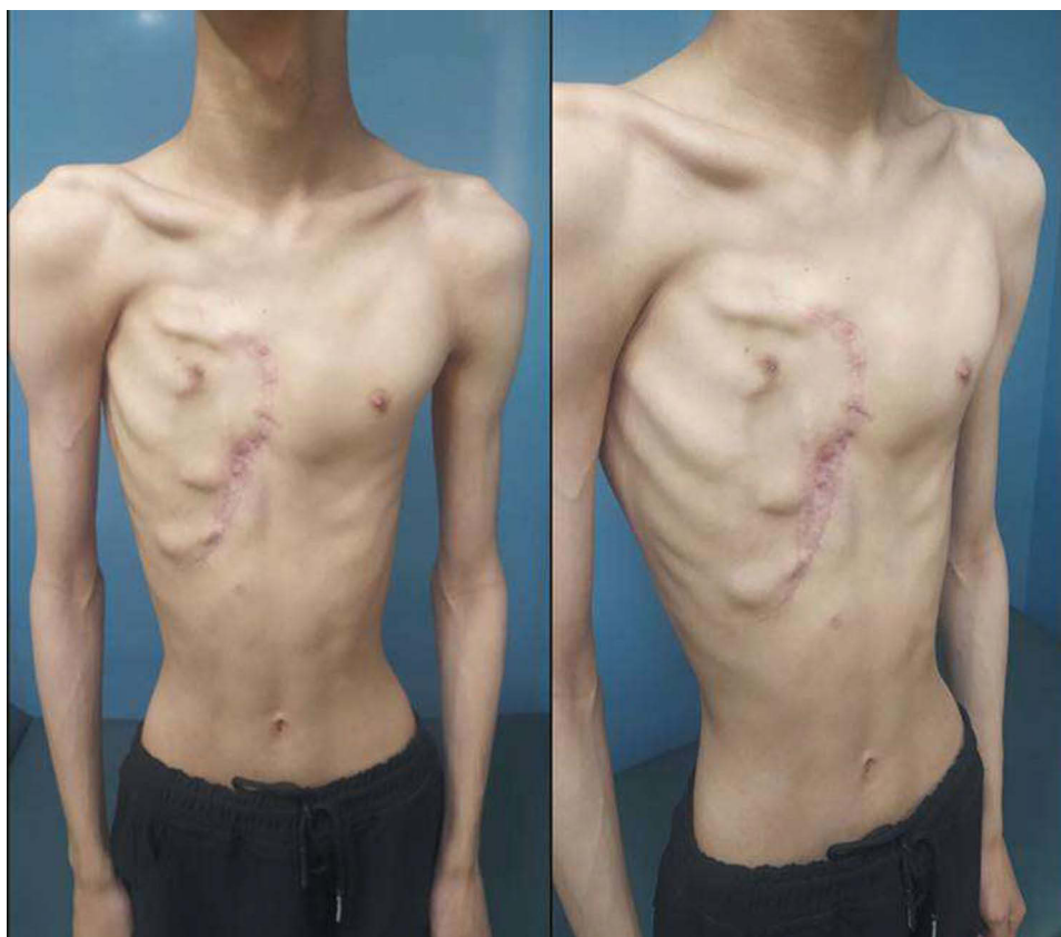
Figure 5 Patient's appearance 6 months after operation.