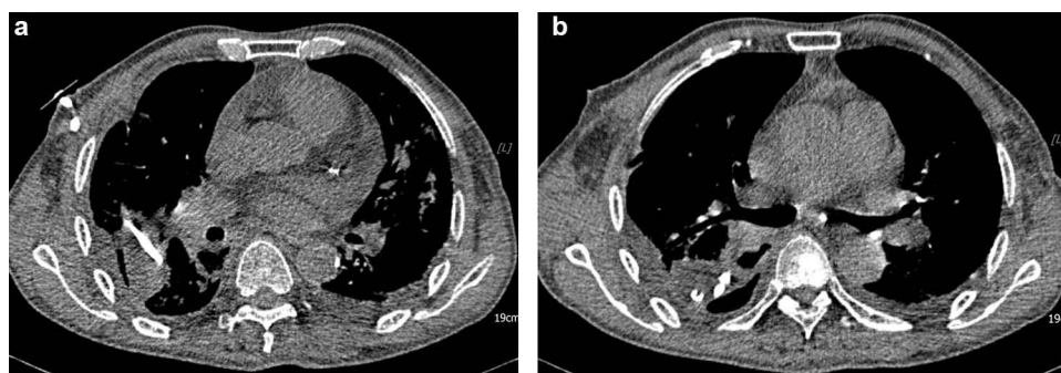
Figure 3 (a and b) Images of chest computed tomography scan of the significant resolution of the empyema cavity and pulmonary inflammation.

Mycobacterium tuberculosis , Pseudomonas aeruginosa , Staphylococcus aureus , Escherichia coli and Streptococcus sp. 12 Most patients need the combination of antibiotics and surgery, especially VATS or a full thoracotomy with decortication. 1,2,13