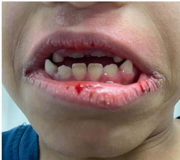
Figure 2 Dry lips with fissures and angular cheilitis.