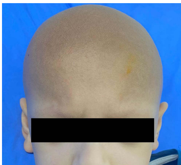
Figure 1 Numerous non-inflammatory follicular keratotic tiny papules on the patient's scalp, eyebrows, and eyelashes.

Based on the aforementioned features, we considered the probability of ectodermal dysplasia (ED); however, further testing was needed to confirm and discover the subtype of ED. Therefore, following the parents' consent, genetic testing was done for the patient, confirming an X-linked recessive inheritance of ichthyosis follicularis, atrichia, and photophobia (IFAP) syndrome. A missense mutation (NM 0158843: C.1499G>A; p. (Gly 500Asp)) in the MBTPS2 (300294) gene located on chromosome Xp22.12 was identified. It was classified as likely pathogenic (Class 2) according to the recommendations of CENTOGENE and ACMG. The result showed an X-linked recessive inheritance of IFAP syndrome without BRESHECK syndrome (absent brain anomalies, severe mental retardation, skeletal deformities, Hirschsprung disease, ear and eye anomalies, cleft palate, cryptorchidism, and kidney dysplasia/hyperplasia), and it was consistent with