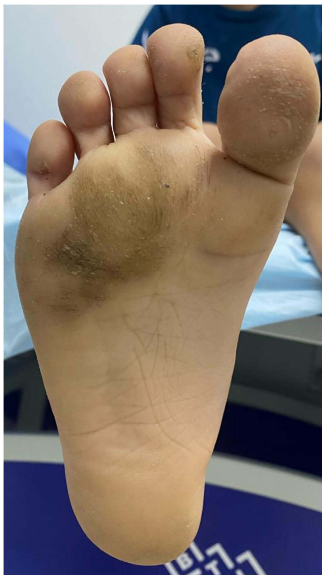
Figure 4 Symmetrical focal thickness and fissures of the skin of both feet revealing plantar keratoderma.

IFAP syndrome have been reported worldwide since the first case reported by Macleod and Collins, and to the best of our knowledge, no case reports of IFAP syndrome have been documented in Saudi Arabia.