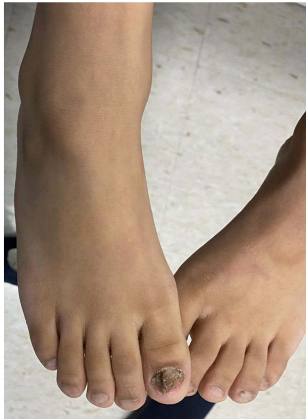
Figure 5 Nail dystrophy of the patient's right big toe with sparing of the contralateral big toe.

papules. Furthermore, the current case developed alopecia of the scalp, eyebrows, and eyelashes along with photophobia in the first year of age, which is also in line with the age at onset reported by Macleod and Collins. 5