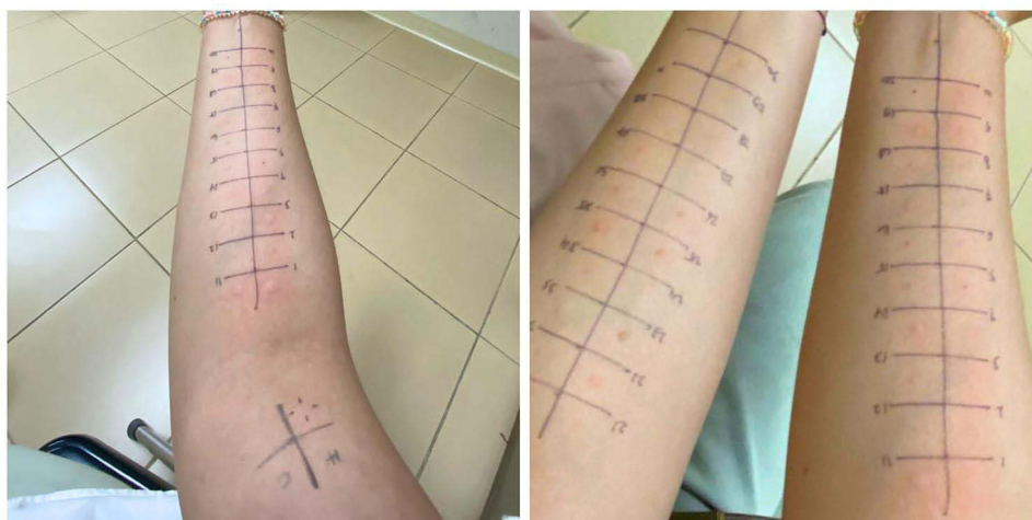
Figure 2 Skin prick test.

A diagnosis of chili-induced GT was confirmed after further investigation. Following both subjective and objective examinations, the patient reported no complaints. The NRS score was 0 (no pain), and the GTASI score was 0.4 (mild). Supplementary extra-oral and intra-oral photos taken during the follow-up visit are presented in Figure 1F–J. The patient was currently advised to avoid consuming spicy foods, including chili, and other known allergens, while also refraining from mouthwashes containing benzydamine hydrochloride.