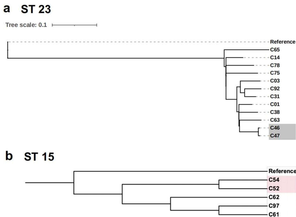
Figure 3 Phylogenetic tree of enrolled strains and clusters of ST23 and ST15 strains. (a) Phylogenetic tree of 13 ST23 strains. (b) Phylogenetic tree of five ST15-KPC-2 strains with similar gene profiles.