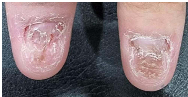
Figure 1 Both thumbnails showed signs of nail dystrophy, including discoloration, loss of cuticles, abnormal shape, depressions in the middle of the nail plate, and thick, flaky scales on the surface.

After three months of trying to alter the behavior, the patient's mother noted some improvement in her daughter's nail-pulling habits. However, the dystrophic thumbnails persist without any noticeable improvement. The patient was looking for an alternative treatment that would be more effective. This time the patient underwent treatment for her