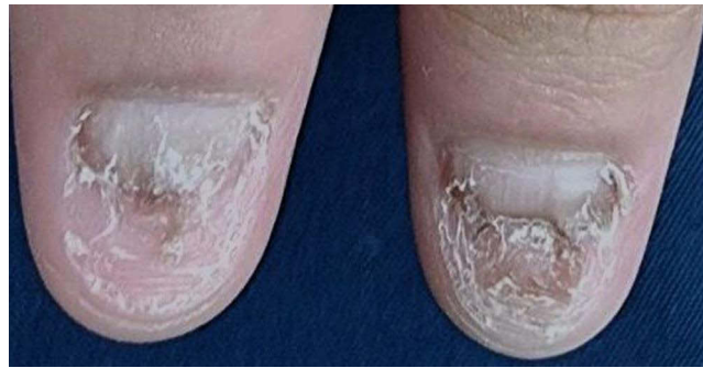
Figure 2 After receiving one PDL treatment, remarkable improvements in the appearance of the nail plate, nail bed, and surrounding skin can be noticed.

After undergoing three PDL treatments, the previously dystrophic thumbnails showed significant improvement. However, it has been noticed that there are some signs of onychotillomania, which include the presence of tiny erosions and bloody crusts on the proximal nail folds. This could suggest that the patient still occasionally pulls at her nails (Figure 4). In order to prevent further damage, the patient was advised to temporarily apply bandages to her thumbnails and keep her nails short.