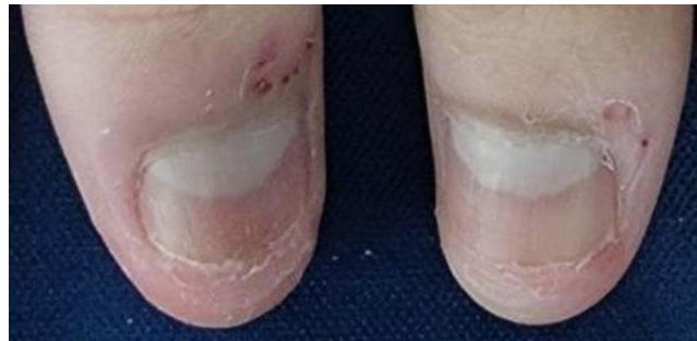
Figure 4 After undergoing three PDL treatments, the previously dystrophic thumbnails have tremendously improved. However, signs of onychotillomania were noticed, including small erosions with bloody crusts on the proximal nail folds.