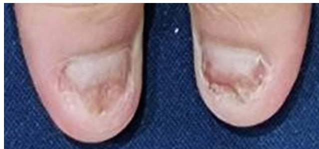
Figure 3 Following two PDL treatments, a significant and sustained improvement has been observed in both thumbnails and periungual skin.