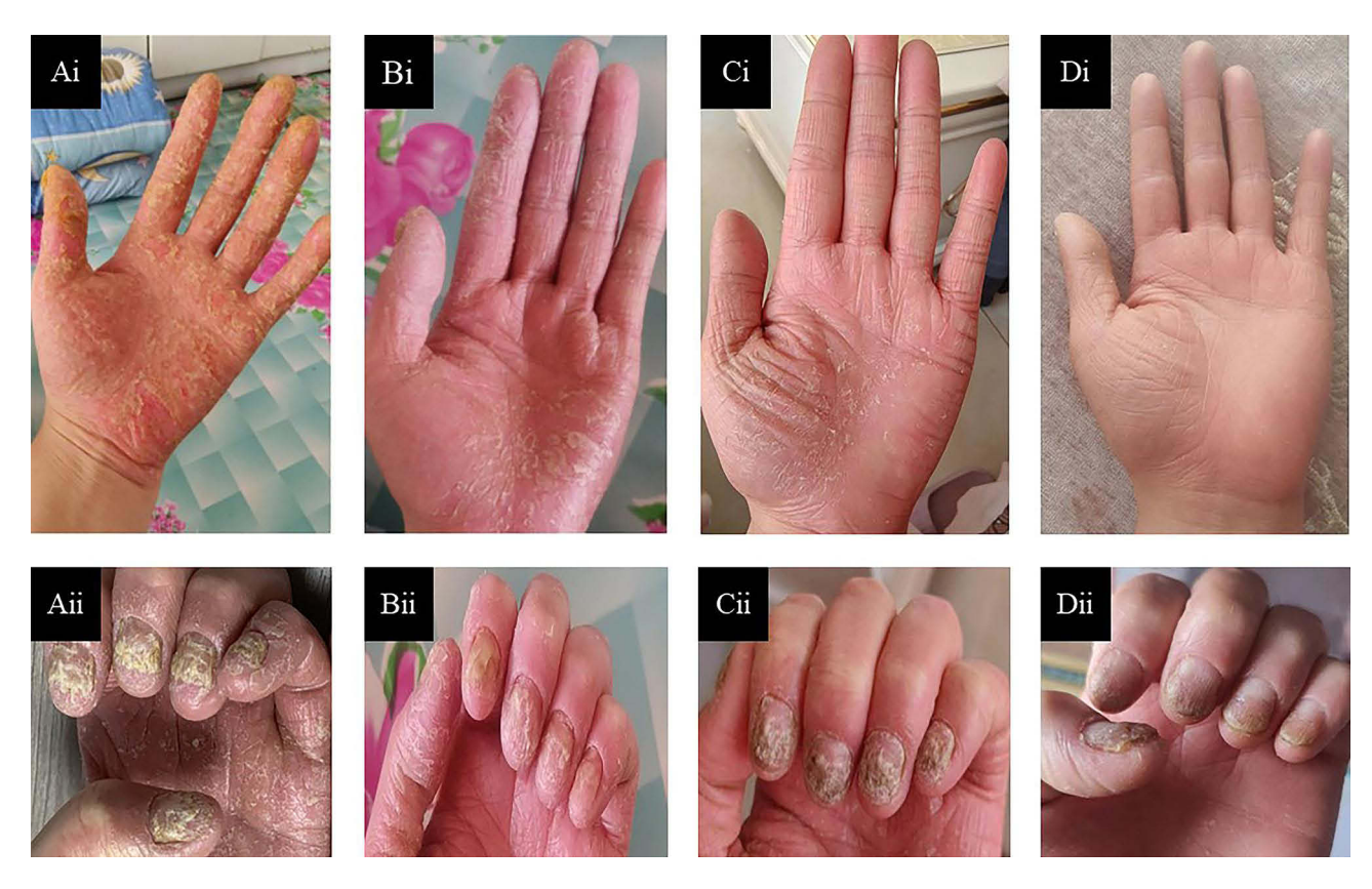
Figure 2 Presentation of severe erythematous keratotic lesions and pustules on the palms (Ai) and yellowing of nails (Aii), suggestive of palmoplantar pustulosis. Improvement of palms (Bi) and nails (Bii) after treatment with secukinumab. The palmoplantar pustules were alleviated after 3 months (Ci, Cii) and 8 months (Di, Dii) of discontinuing secukinumab and receiving treatment with tofacitinib.