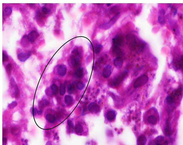
Figure 2 High power microscopic view shows splenic tissue with prominent histiocytic infiltrate. The black circle indicates the numerous leishmania amastigotes.

world. Unfortunately, this number may be even higher since most VL deaths are not identified as being caused by leishmaniasis or are not reported. 4