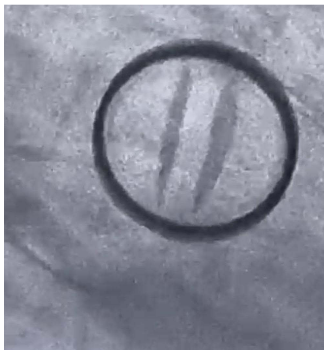
Figure 2 Cinefluoroscopy of AVR showing normal function of both valve leaflets.

After 6 months of close follow up, repeated cinefluoroscopy for aortic valve was done which revealed normal motion of both PVR leaflets (Figure 2).