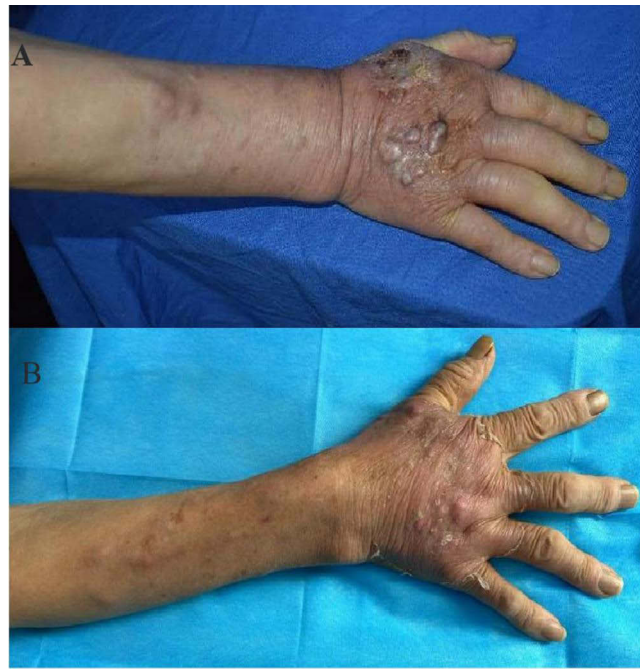
Figure 3 (A) Terbinafine hydrochloride tablets were taken orally for 2 weeks. (B) Itraconazole capsules were taken orally for 2 weeks.