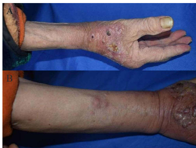
Figure 1 The right hand presented with lesions before treatment.

Additionally, we obtained pus and subcutaneous tissue from the dorsal skin of her right hand for bacterial smear and culture, fungal smear and culture, and acid-fast bacillus smear. The result showed negative acid-fast staining, occasional Gram-negative bacilli in the general bacterial smear, yeast-like fungal spores and hyphae in the fungal smear examination (Gram staining), growth of various coagulase-negative staphylococcus in the bacterial culture of pus and tissues, and the presence of Paecilomyces species in the fungal culture of pus and tissue. Mass spectrometry confirmed the identification of Paecilomyces (as shown in Figure 2A–C).