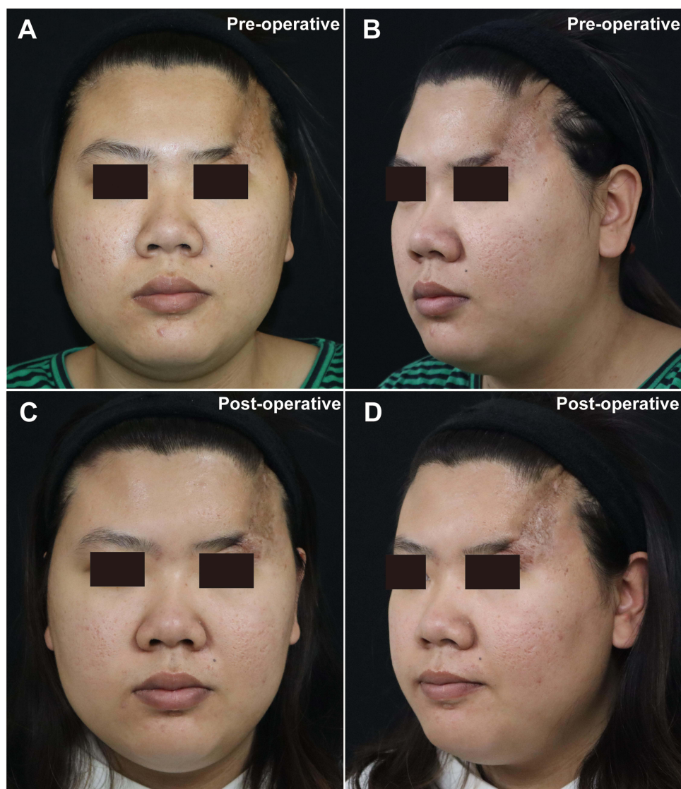
Figure 1 Facial photography of the patient. (A) Pre-operative front photo, (B) Pre-operative left 45-degree photo, (C) Post-operative front photo, (D) Post-operative left 45-degree photo.

In April 2023, the patient decided to undergo surgical treatment to improve the tissue depression but refused to undergo an excision procedure; thus, autologous fat grafting was chosen for treatment (Figure 1). For screening of brain involvement and preoperative planning, the patient underwent a 3D Dixon MRI examination targeting both the head and facial soft tissues before performing surgery, 4 and the MRI suggested that a speckled slightly long T2 signal shadow