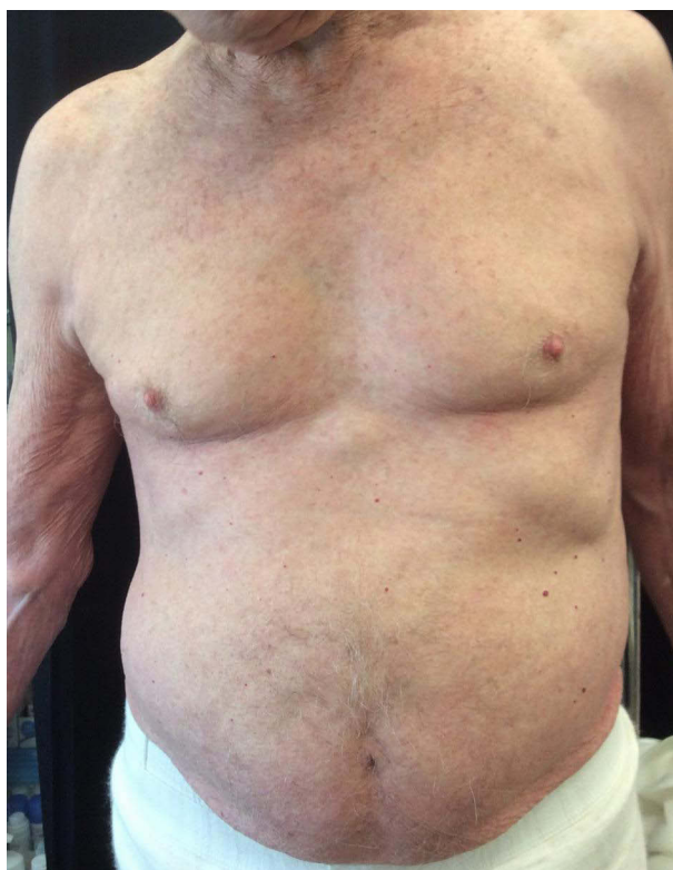
Figure 3 Clinical remission of both psoriatic and PB lesions on the trunk after DMF therapy.