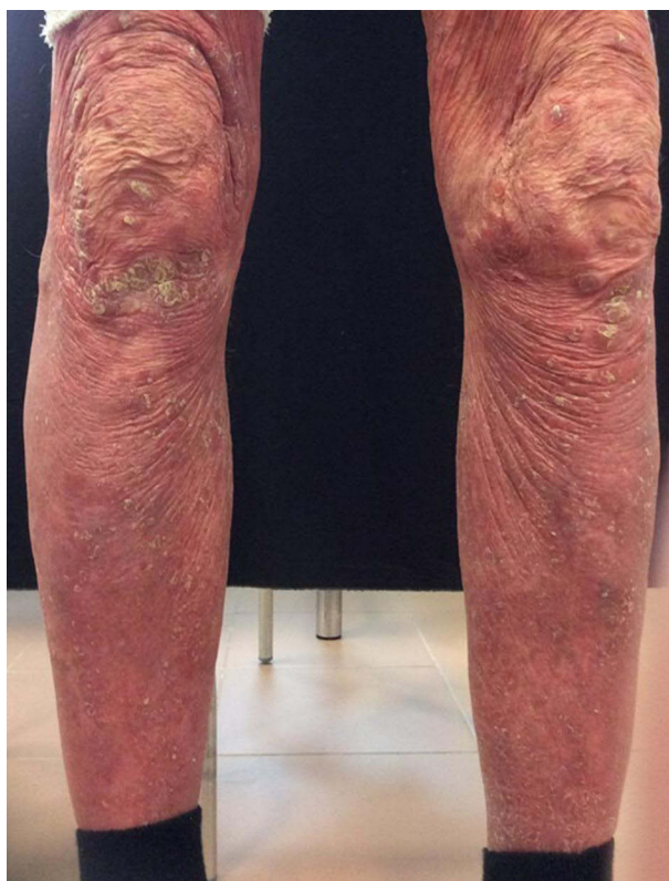
Figure 2 Psoriasis worsened (lower limbs).