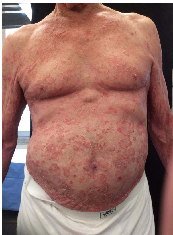
Figure 1 Psoriasis worsened (trunk).

Autoimmune blistering diseases of the skin may be observed in patients with psoriasis, BP being the most frequently reported. There is no standardised therapeutic approach to coexistent psoriasis and BP. Corticosteroids are the mainstay of treatment for BP. However, their use is limited in diabetic patients due to the risk of acute hyperglycemic complications, particularly in elderly patients. Recently, a successful treatment with dupilumab, a fully human monoclonal antibody targeting the IL-4 and IL-13 signaling pathways, was reported. 6 However, cases of dupilumab-induced psoriasis are also described. A potential functional role of the proinflammatory cytokine IL17A has been shown leading to IL17A inhibition as a promising therapeutic strategy. 7 Therefore, emerging, novel targeted therapeutic approaches in BP are being awaited with great interest. DMF was able to control both psoriasis and BP in our patient. However, treatment was