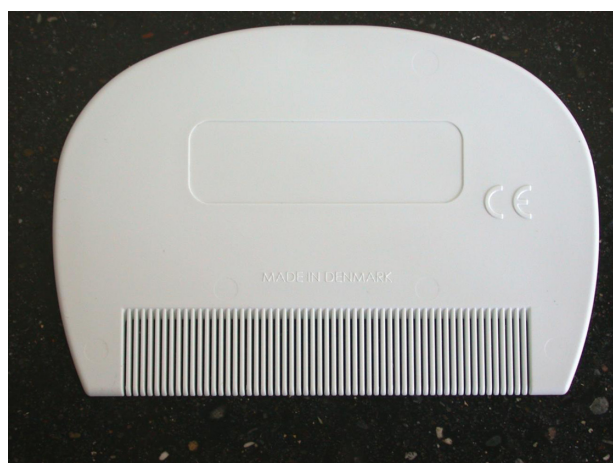
Figure 1 The 'PDC' head louse detection comb.

Treatment allocation was derived from an online computer-generated list. 9 Allocation at the point of delivery was made from instruction sheets enclosed in opaque, sealed, sequentially numbered envelopes distributed to investigators in balanced blocks of eight. A copy of the listing was prepared