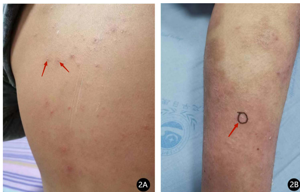
Figure 2 (A and B) White pustules on the lower extremities and trunk (red arrow in (A and B)).

discontinued dupilumab, and the child was continued on anti-allergic and topical moisturizing emollient treatment. The erythematous papules and pruritus reduced considerably after treatment compared to before, and no new pustules appeared after modifying the patient's treatment. The patient is under regular follow-up.