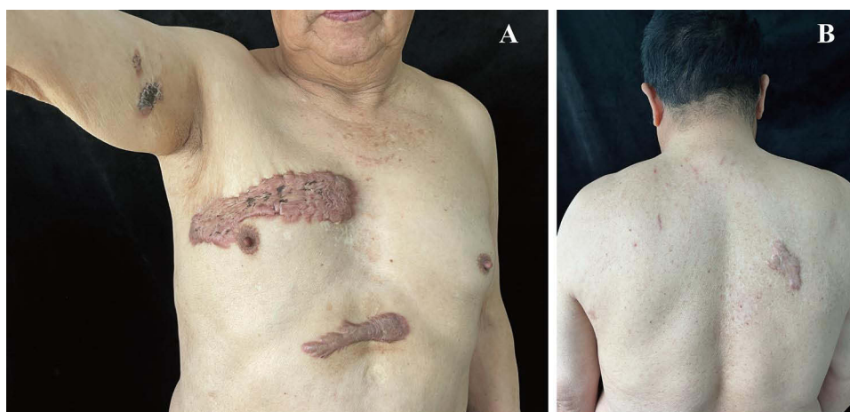
Figure 1 Dermatomal distribution of keloids at the site of healed herpes zoster. (A) The patient had multiple plaques in the right trunk and arm, corresponding to dermatomes T2–T3 and T7, with the largest located in the right chest T2–T3 dermatome, measuring 19 cm (L) × 5 cm (W); (B) The patient had a right dorsal plaque, not beyond the midline.