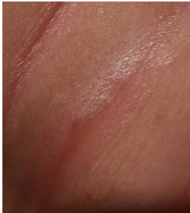
Figure 3 The eruption diminished after hair removal.

migratory feature of CPM, it is often misdiagnosed as Cutaneous Larval Migrants (CLM), despite the fact that CLM is characterized by intensely pruritus and the ability to move in any direction.