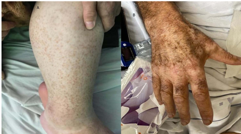
Figure 3 New skin manifestations (A) pigmented purpuric dermatosis (B) vitiligo-like rash.

were more likely to have rashes, although this did not reach statistical significance for loss of smell. Patients who had pruritus were likely to have a skin rash compared to those without pruritus ( P=0.001 ).