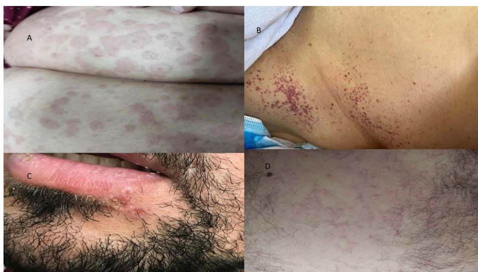
Figure 2 Cutaneous manifestations of COVID-19; (A) erythema multiforme, (B) petechial rash, (C) herpes simplex, (D) urticarial rash.

oral (30.6%), 15.3% had a rash on the head, 1.7% on the neck, 15.3% on the upper limbs, 10.2% on the lower limbs, and 26.9% on the chest or trunk. About 6.8% of patients had a generalized rash. Rashes were asymptomatic in more than one-third of patients (38.6%) and were itching or painful in 61.4% of patients. The duration of the rash varied from 1 to 30 days with a mean (SD) of 7.45 ( \pm 5.5 ) days.