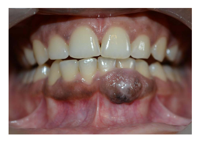
Figure I Pre-operative photograph of gingival enlargement.

A 25-year-old woman reported to our dental clinic with the chief complaint of a swelling in the gums in her lower anterior region of two years duration. The patient reported no significant medical history. She had undergone fixed orthodontic treatment fifteen years back. She noticed a small growth in her gums two years back which slowly increased to the present size. The growth was asymptomatic. Intraoral examination revealed the presence of a localized pigmented gingival enlargement [GE] extending from lower left central incisor [31] to lower left canine [33] region, measuring 13 \times 8 mm in size. It involved the labial, marginal as well as attached gingiva (Figure 1). The enlargement was brownish black in colour, indurated, rough textured with a sessile base and firm in consistency. The GE also extended partially over the crown surface. Plaque and calculus deposits were minimal, with no bleeding on probing seen. Deep pockets (6–8 mm) were recorded on the labial aspect of the affected teeth. Radiographically, both the orthopantomograph (OPG) and Cone beam computed tomography (CBCT) images showed only mild bone loss in the labial plate of lower anterior teeth (Figure 2).