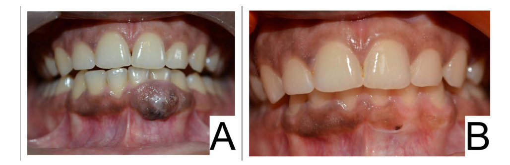
Figure 5 (A) Preoperative and (B) one-year post-operative photograph, showing a focal area of hyper-pigmentation.