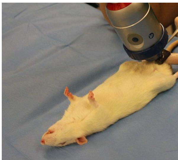
Figure 1 LE-ESWT of rat penis. The procedure is shown with the head of the probe at the penis of the anesthetized rat.

Blood sugar levels were measured periodically via tail-blood samples. Two weeks after the last session of LE-ESWT treatment, the rats were weighed, had a final tail-blood glucose measurement performed, and were sacrificed. Ventricular