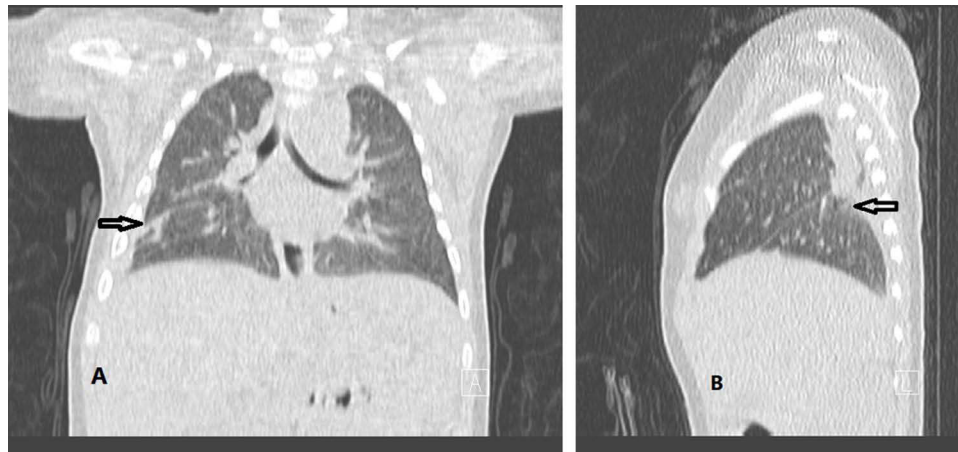
Figure 3 (A) Chest-CT after 8 weeks, the black arrow shows resolution, with minimal residual inflammatory zones. (B) Chest-CT after 8 weeks, the black arrow shows resolution, with minimal residual inflammatory zones.

as well as right cystic lesions. A chest-CT scan suggested the diagnosis of congenital pulmonary airway malformation CPAM. An echocardiogram was performed, which revealed normal findings. Blood culture was sterile. Multidisciplinary team discussion was held with the pediatric radiology, pediatric pulmonology, and neonatal intensive care teams, and the decision was made to monitor this baby closely with the indication of surgical resection if there was no improvement or clinical deterioration occurred within the same admission. The respiratory distress was treated with low-flow nasal oxygen with a 50% fraction of inspired oxygen (FiO 2 ), along with intravenous antibiotics. After 7 days of close monitoring, clinical improvement in the neonate's status was observed. She was taken off oxygen, signs respiratory distress disappeared, and normal feeding resumed with effortless discharge. Out-patient follow-up and reassessment was held after 8 weeks (to help lungs to recover from pneumonia and for better radiological assessment away from the inflammatory process). A control chest-CT was performed after 8 weeks and showed complete resolution of these cystic lesions, with only a picture of post-pneumonia healing changes (Figure 3A and B).