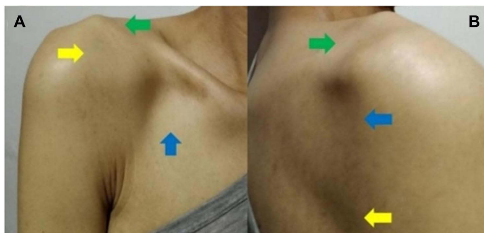
Figure 1 Clinical presentation. The patient was asked to lift and abduct the proximal end of the right upper limb, and it was observed that the patient had failed to lift and abduct the proximal end of the right upper limb (A). Visual examination showed a square shoulder deformity (A, green arrow) and mild atrophy of the right pectoralis major (A, blue arrow), right deltoid (A, yellow arrow), right supraspinatus (B, green arrow), right infraspinatus, right teres minor (B, blue arrow), and right latissimus dorsi (B, yellow arrow).

On the third day of admission, only physiotherapy and symptomatic supportive treatment, such as ibuprofen was given, the patient reported that the pain in his right shoulder had decreased, his right upper limb could be lifted upwards by 30–40° and he had approximately 30° of abduction. To clarify the cause of severe pain and weakness of the shoulder and arm muscles, We performed MRI neuroimaging of the bilateral brachial plexus nerves using high-resolution T2-weighted, fat-suppressed sequences. The examination revealed irregular hyperintense signal abnormalities in the multifocal distribution regions of the brachial plexus (Figure 2) and signs of muscle denervation (diffuse hyperintense signal abnormalities) were found in the right supraspinatus, right infraspinatus, right teres minor, right deltoid, right pectoralis major, right latissimus dorsi, right biceps brachii, and right triceps brachii muscles (Figure 3). Electrophysiological studies (Figure 4) were further carried out to clarify the extent of the patient's peripheral nerve injury, and the motor conduction velocity (MCV) examination showed that the right median nerve action potential (MNAP) was decreased. Compound muscle action potential (CMAP) examination showed that the