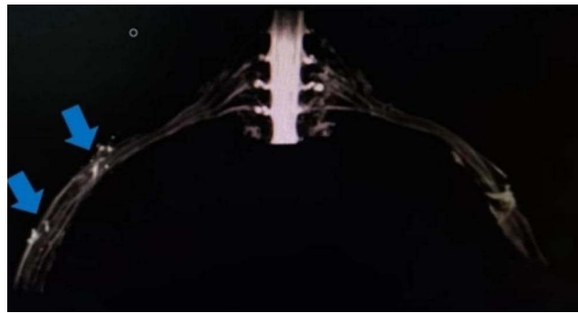
Figure 2 MRI neurography of the brachial plexus. Irregular hyperintense signal abnormalities in the multifocal distribution regions of the brachial plexus (blue arrow) was observed on T2-weighted magnetic resonance imaging (MRI) in patients to support neuralgic amyotrophy is likely related to an autoimmune process.