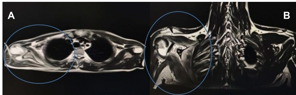
Figure 3 MRI neuroimaging of the brachial plexus. MRI neuroimaging of the brachial plexus can also observe that mild right muscle atrophy (A, blue circle) and the T2 high-signal area of the affected brachial plexus branches with their innervated muscles including the right supraspinatus, right infraspinatus, right teres minor, right deltoid, right pectoralis major, right latissimus dorsi, right biceps brachii, and right triceps brachii muscles (A and B, blue circle).

latency (Lat) of the right musculocutaneous nerve, right axillary nerve, right radial nerve, right suprascapular nerve, right lateral thoracic nerve and right thoracodorsal nerve were in the normal range, and the amplitudes (Amp) were decreased. EMG displayed “+” spontaneous electric activities of the right abductor pollicis brevis, right deltoid and right infraspinatus muscles during the resting state and spontaneous generating activities of the right interosseous, right extensor digitorum communis, right biceps brachii, right pectoralis major, right infraspinatus, right triceps brachii and right latissimus dorsi muscles during the resting state, with the maximum forced recruitment of a small amount of MU, simple patterns and mixed simple patterns. The above positive results indicated neurogenic changes in the right upper limb, along with neuroaxonal damage. Based on medical history, MRI neuroimaging of bilateral brachial plexus and Neuro-electrophysiological studies, We properly speculated Brucella infection are believed to trigger an immune-mediated reaction leading to Neuralgic amyotrophy.